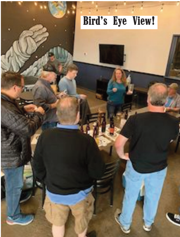
Bird's Eye View!