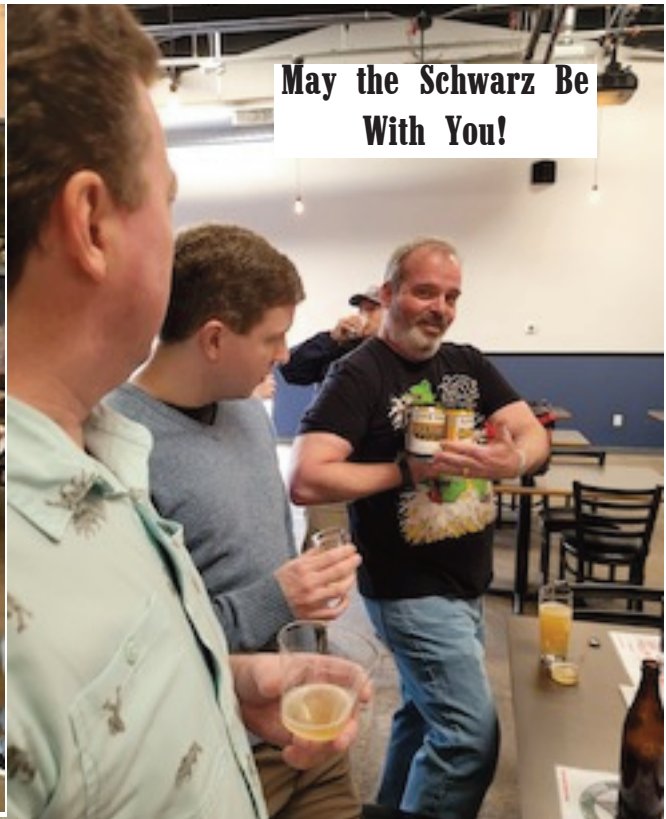
May the Schwarz Be With You!