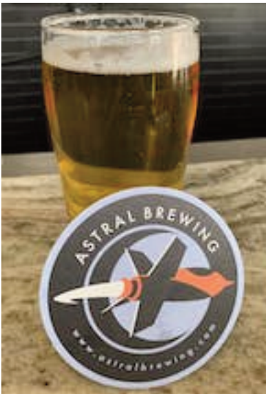
Astral Money Shot!