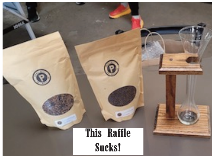
This Raffle Sucks!