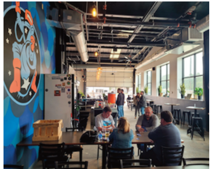
Do You Have Any Jacks?