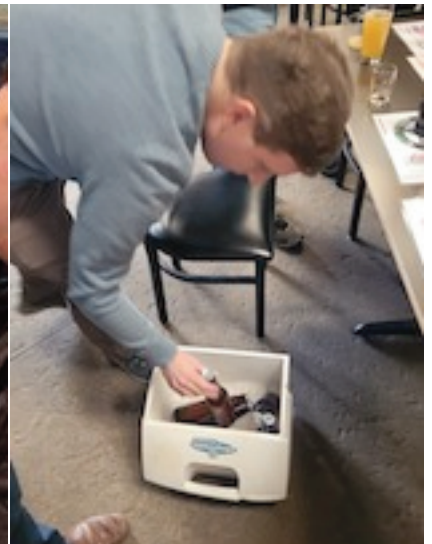
Going For the Gusto!