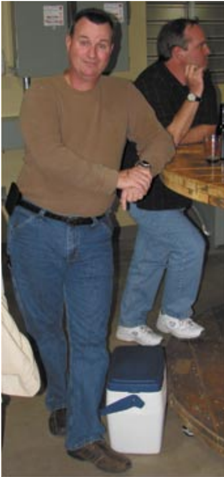
You know you want what's in the cooler!