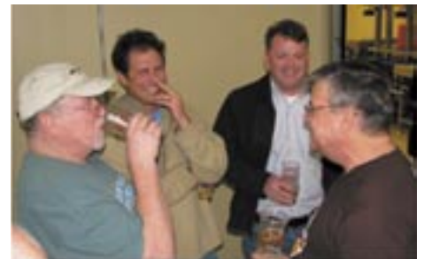
No, seriously... When are all of you leaving?