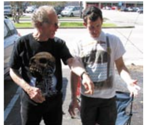
No Cliff, it's step, ball change... then the jazz hands!

BREW ★ ENTER ★ JUDGE ★ WIN THE CONTESTS OF THE LONE STAR CIRCUIT!