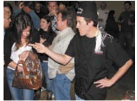
The Waz "strikes a pose."