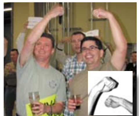
Wonder twins power... Activate!