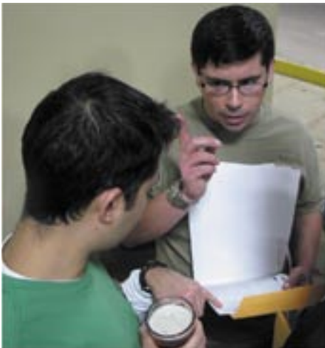
Shame on you for using a word like that about one of my beers!