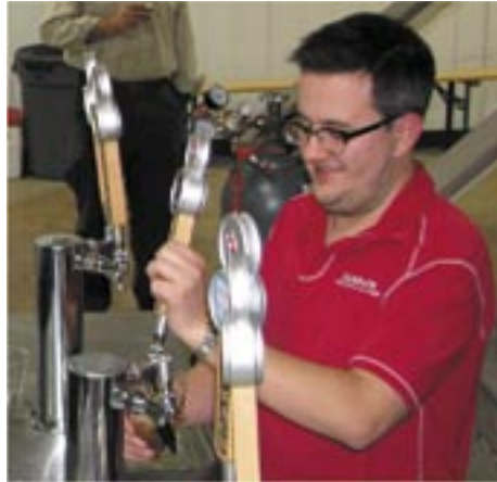
I think the kid likes it!