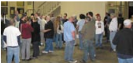
Woops, forgot our tents!