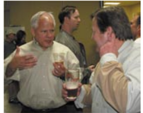
Just a drop of I.P.A. behind the ears, drives the women crazy!