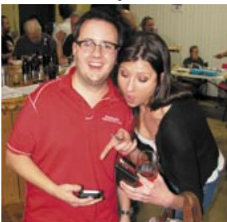
Geeks get all the chicks...