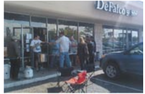
The Waz draws a crowd for his brew day (or maybe for the beer...)

So get brewing, get feedback and let's kick some Zealot butt!