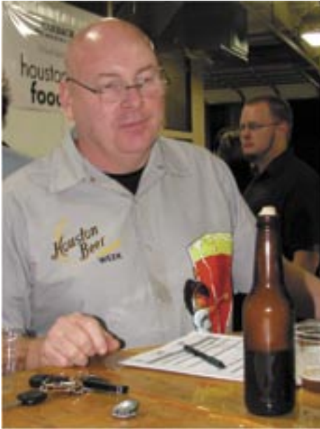
Great, it's one of those beers...