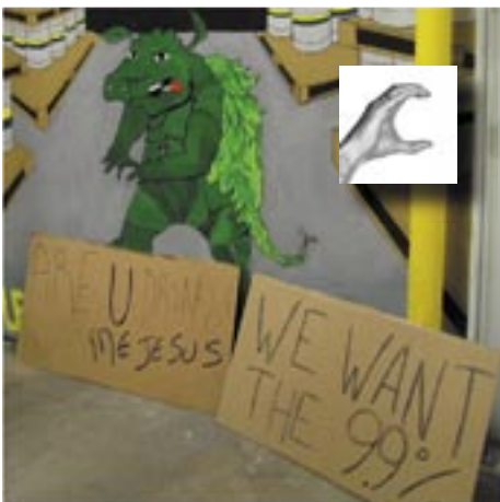
Hopadillo don't give a shit...