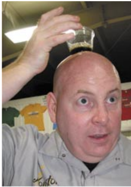
What's up with the hands?