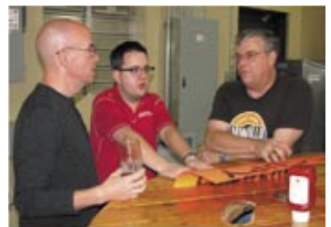
No, I don't think ya'll caused any permanent damage..