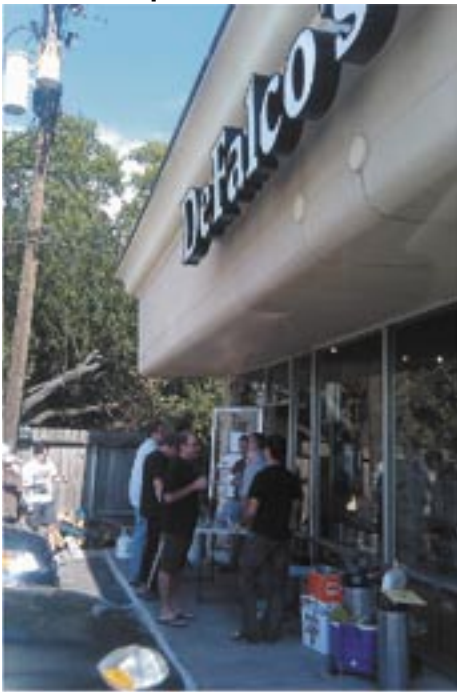
A beautiful brew day outside DeFalco's!