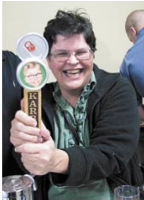
Oh man... Not again!