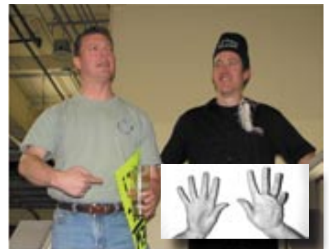
We need to impeach this guy!