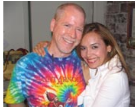
This picture's going to get me in trouble at home...