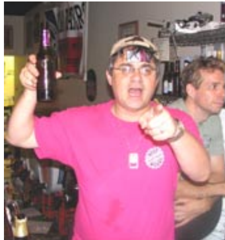
YOU! Have you tried this? Get over here!