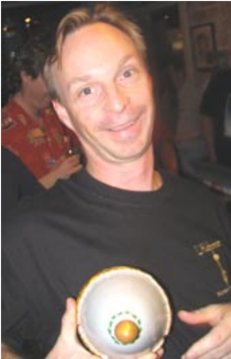
And you thought the Bluebonnet Cup was only phallic!