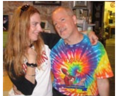
And these? These are just trouble no matter HOW you take it...