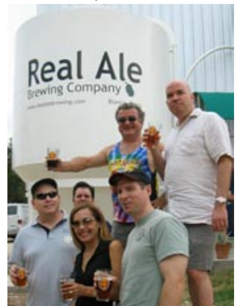
Rangers at Real Ale's anniversary party