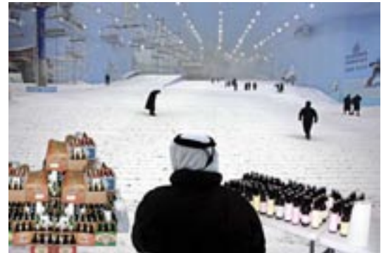
Dubai Ports officials demonstrate their cold sorting procedures at the Dubai Ski Dome