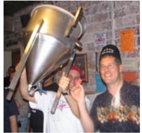
Some people just can't handle a photographer in a kilt...