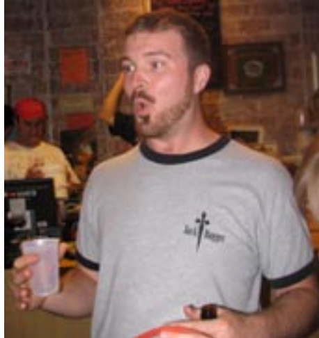
Wooooooo! I like this Beer...