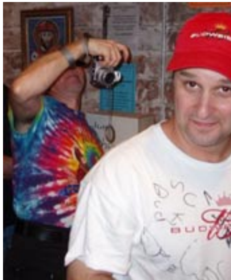
Please tell me he's not taking a picture of my ass...