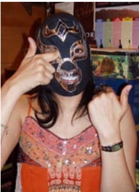
This is fun, but I really need to be going...