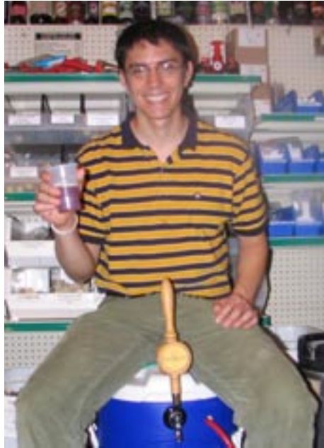
Do I really need to caption this?