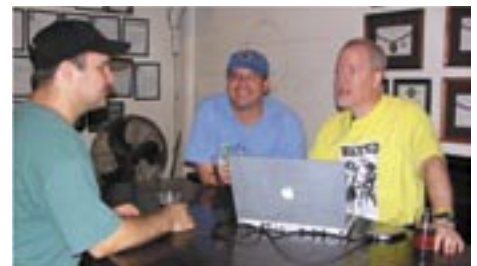
Eeny, meeny, miney, map, check the homebrews by the cap...