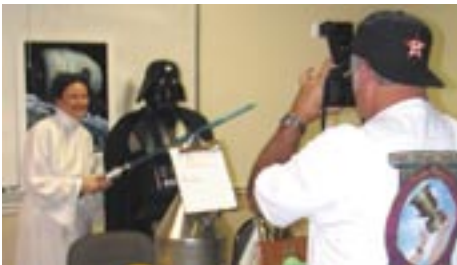
Father & daughter day at Dixie Cup...