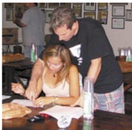
No honey. MY beer gets a 48...