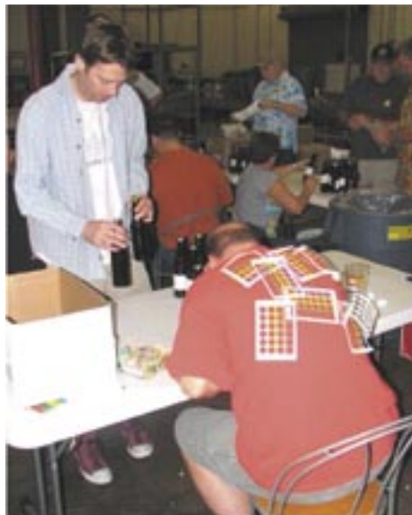
It's all about focus... or the lack thereof.