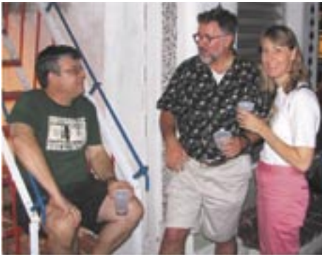
For some it's a staircase, others a convenient seat.