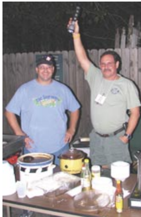
If they're willing to let you see it, you know it must be pretty good!