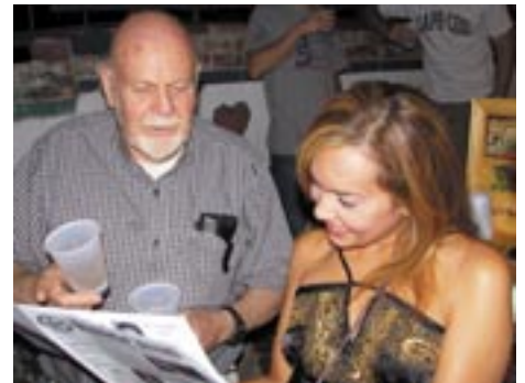
Wait, wait... You mean you LET Bev take pictures of you like that?