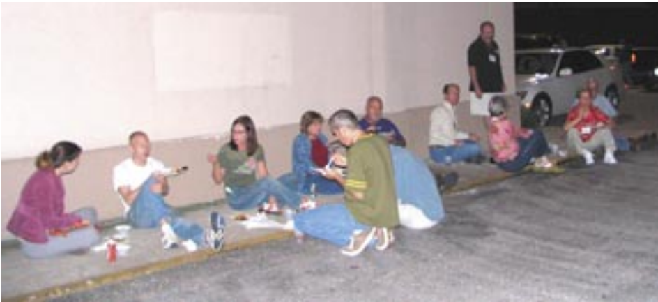
Luxurious potluck seating awaits all who attend!