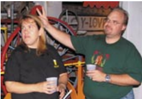
Just call him "Mr. Subtle"