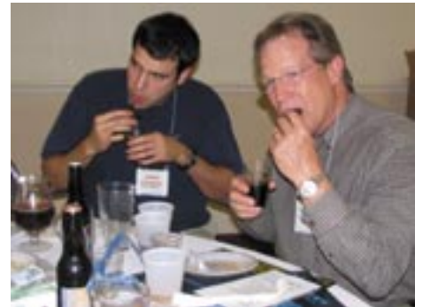
Am I doing this cookie dipping thing right?