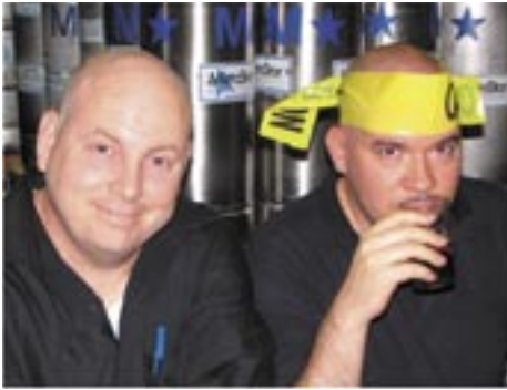
Quality judges require quality supervision...