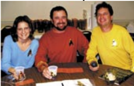
Star WARS, Zealots! Star WARS!