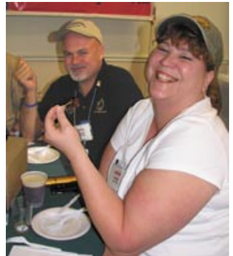
"Why yes, I DO enjoy getting fudged!"