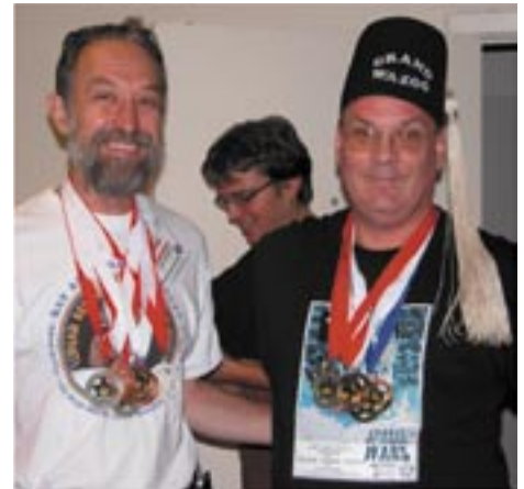
The Mission Commander & Grand Wazoo celebrate