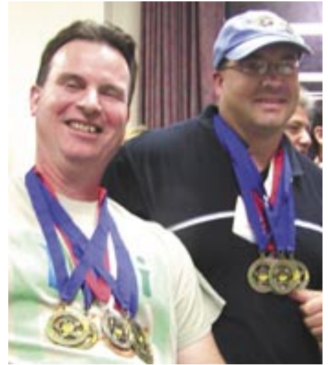
The J&J Brew Crew rakes in the medals