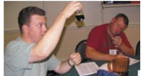
"I don't know about you, but MINE has 'floaties'!"