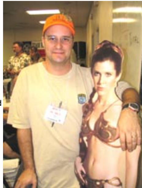
Chief Steward is a lonely job... most of the time.