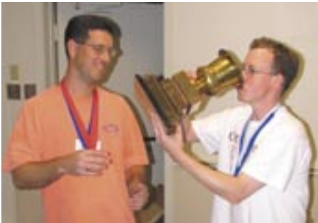
Barleywine, dust and brass: tastes like victory!