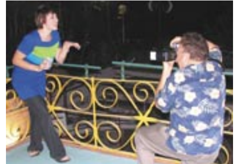
You're a lemur, baby!