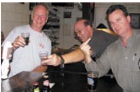
Enough posing guys, someone give me a beer!