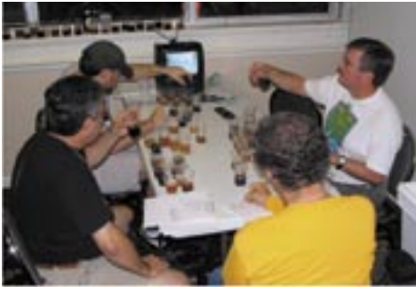
It was the Best of Show & worst of World Series