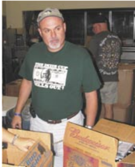
What was that about storing my entries outside in the sun?