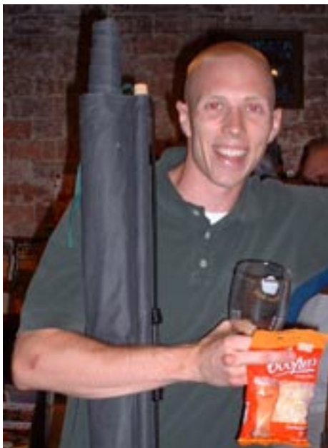
Must have been beginner's luck on the raffle... OR MAYBE HE'S SATAN!!!!