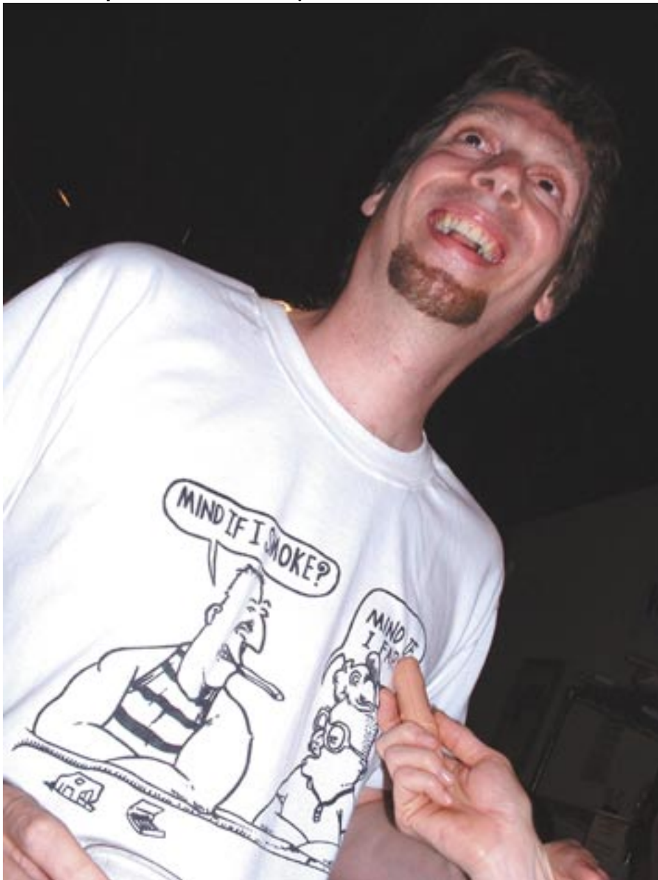
“Ooo... I rather fancy that!”