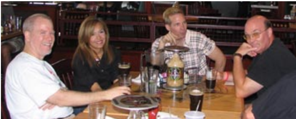
The last to leave from First Sunday at BJ's Clear Lake