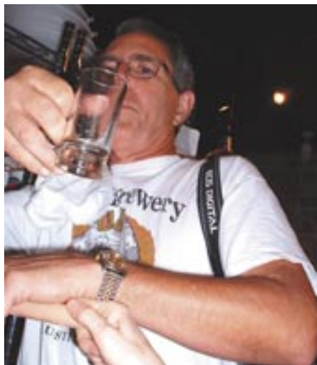
“Git it OFF me!”

“It's a perfectly NATURAL thing, okay?? and NO, you can't play with it...”