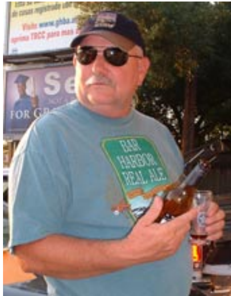
You got a problem with-MY beer?