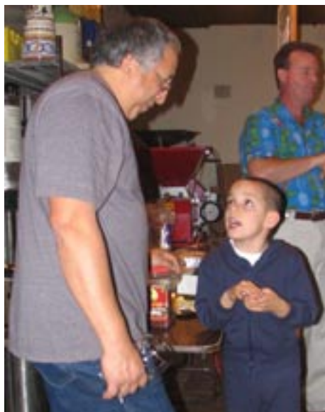
"I make stouts when I brew, they go better with mommy's cookies."