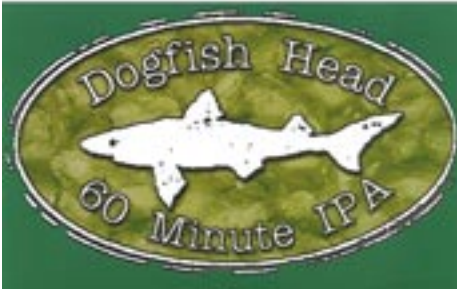
The continually awesome bottle conditioning India Pale Ale