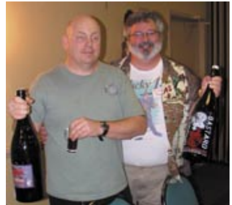
Big beer, big bottles...