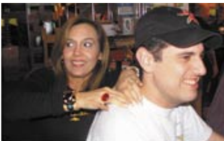
No, I am NOT working for tips.

"Please, make the voices in my head STOP!"