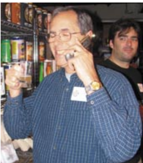
Mr. Excitement gets an exciting phone call...