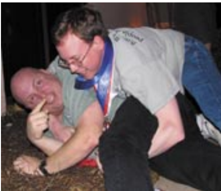
“He wins a few medals and sud- denly he thinks can kick every- one’s ass.”