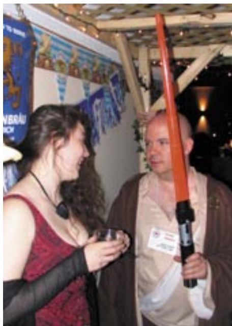
Redneck Lightsaber Practice