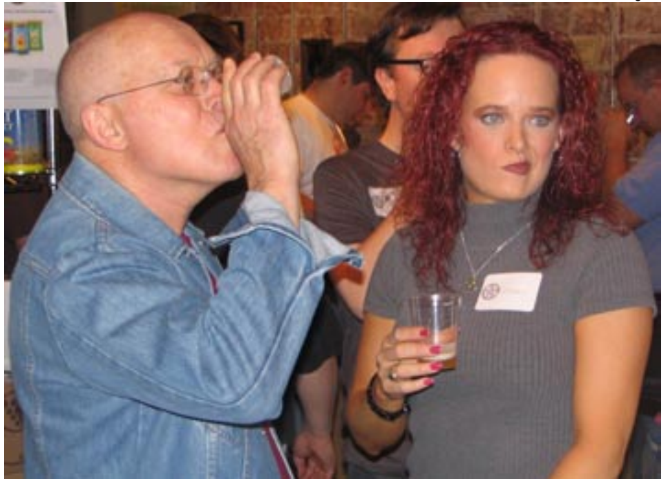
Belgians: Some people love 'em, some people don't