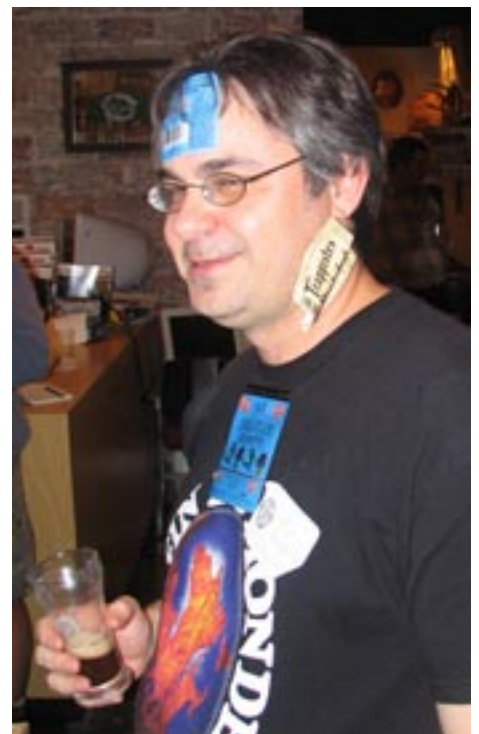
T-Bob: Fashion Trendsetter