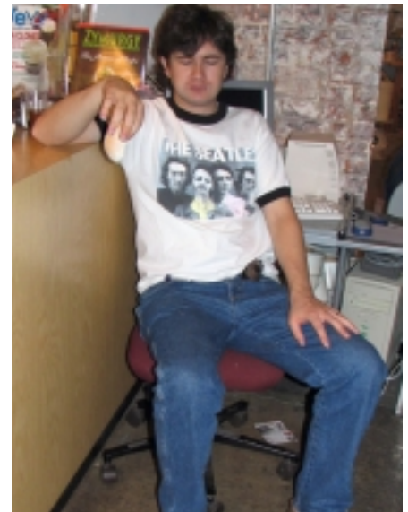
Editor's note - I thought this guy exemplifies the spirit of our club, and should have gotten more votes for Grand Wazoo!