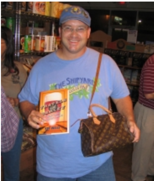
What me a handbag-carrying sissie boy... nooooooo!