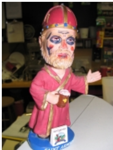
New mascot - Chuckee St. Arnold