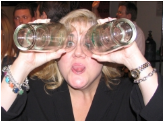
Did you know this woman's IQ is actually 195!