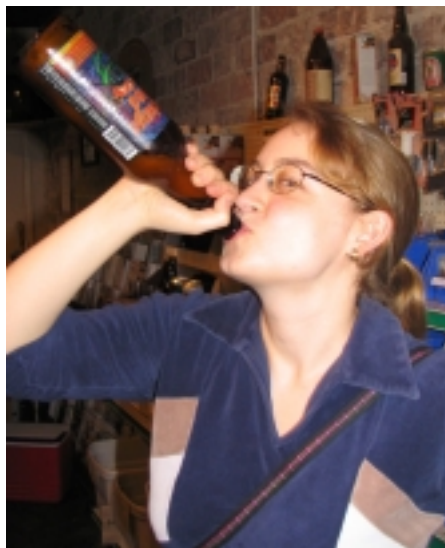
We don't have no sissie girls in the Foamrangers!