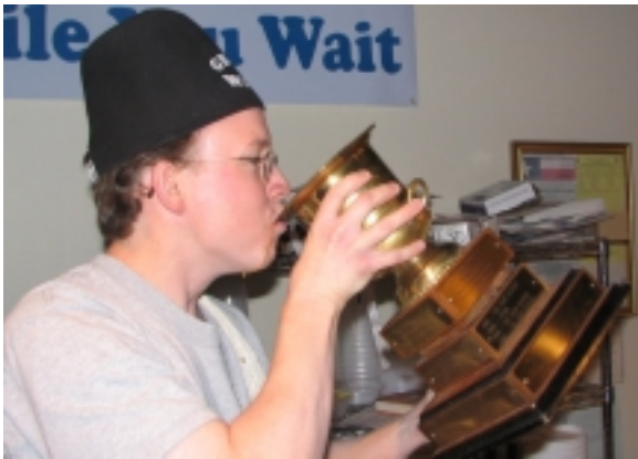
To the victor, goes the spoils!