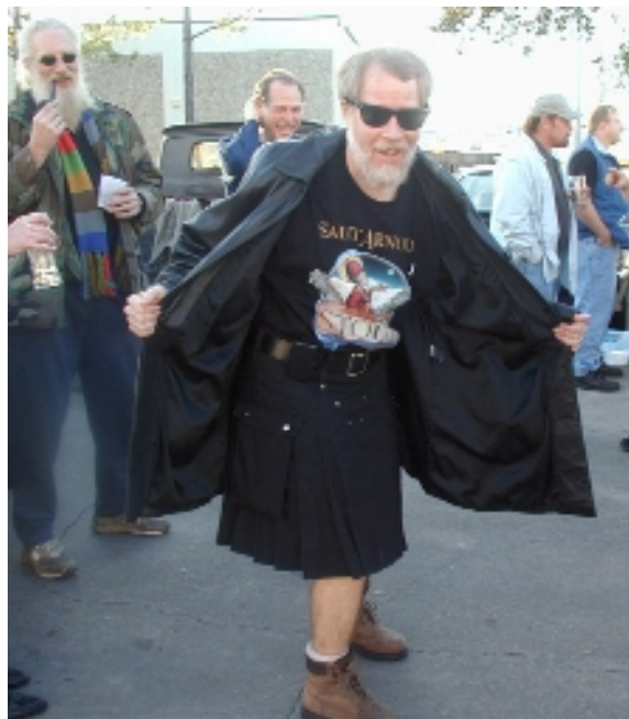
Wow! is that the star of the new Batboy musical?