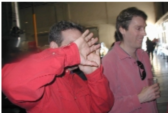
No, please i can't take any more barleywine