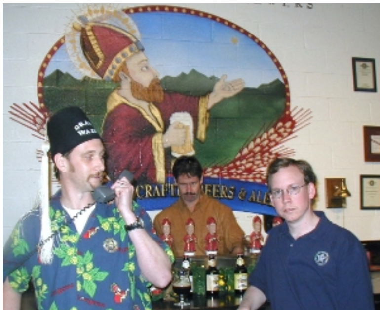
It's St. Arnold and he says just because you're the most important man in homebrewing, you can't call him Arnie!