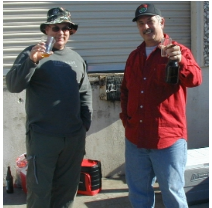
Well we like huntin' too yer know