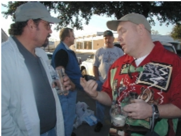
Yeah, i'm gonna win more medals than that guy behind us this year