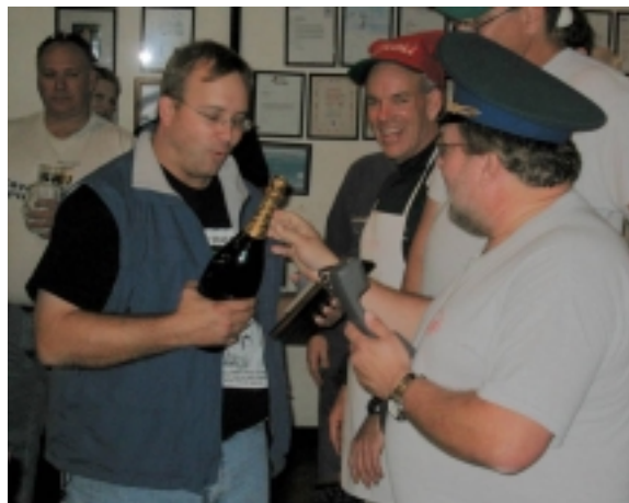
Ooooooohhhh, yeah!, that's the way i like my bottle rubbed...