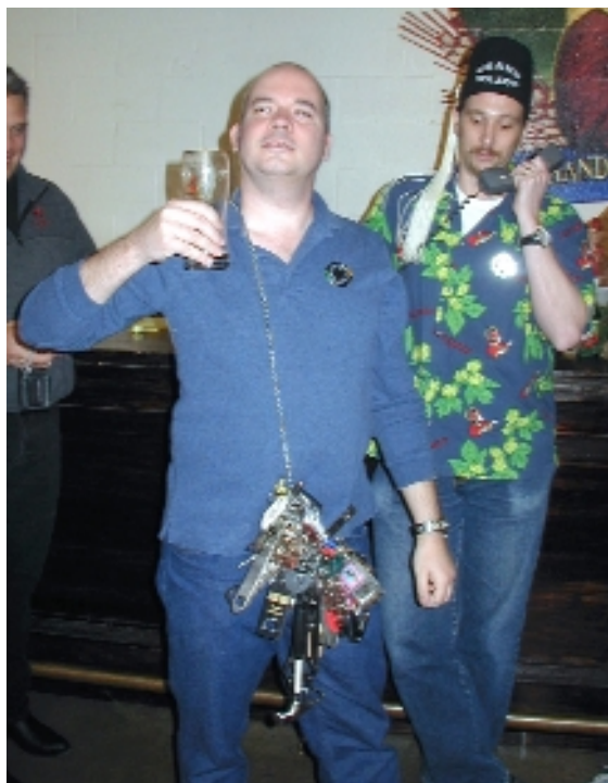
How's this for a sporran, laddie?